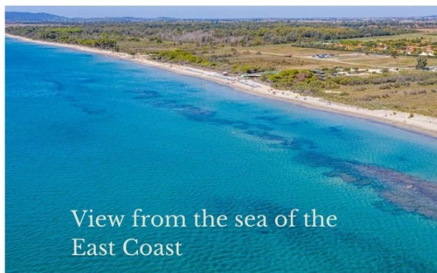
View from the sea of the East Coast