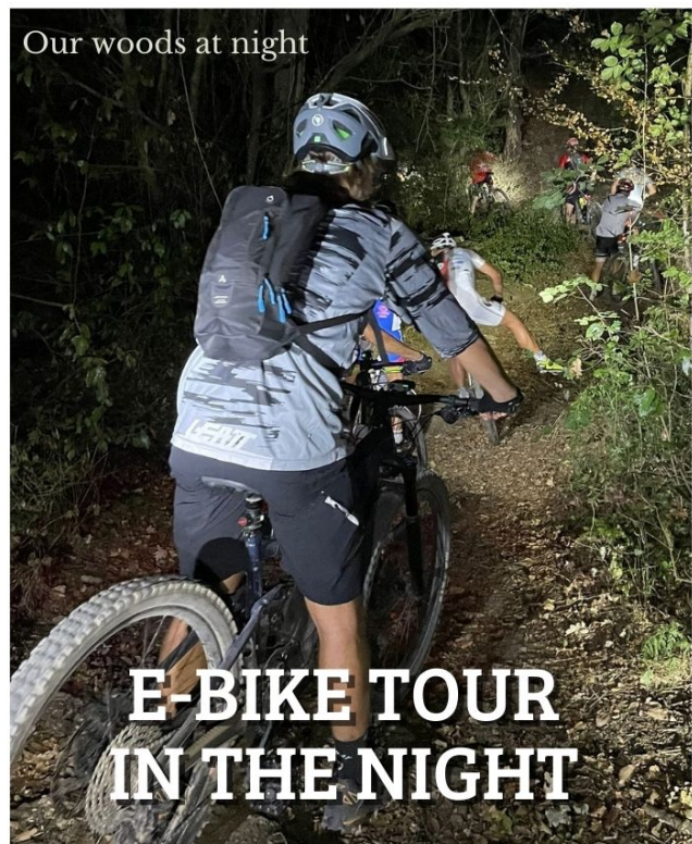
Our woods at night