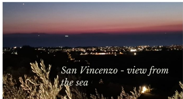
San Vincenzo - view from the sea